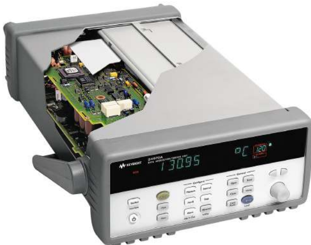
Figure 1. Shown here is the 34970A DAQ system with built-in 6½ digit DMM.

Data loggers like the Keysight 34970A and 34972A DAQ systems use highly accurate, integrating analog-to-digital (A/D) voltmeters to measure the various inputs routed to them via multiplexer cards. The 34970A and 34972A, for example, employ a 6½-digit DMM with a noise floor equivalent to the Effective Number of Bits (ENOB) to 1 bit out of 24 (Figure 1).