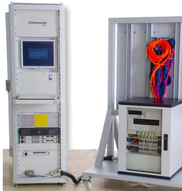
Figure 1. The LXinstruments Burn-In Test System with the Keysight 34980A Switch/Measure Unit.

The solution developed by LXinstruments is to create a modular multiplexed architecture, based on the Keysight 34945A breadboard module for the 34980A Multifunction Switch/Measurement Unit, which allows the DUT's to be switched between common power supplies. This solution is fully scalable allowing it to cater to a varying number of DUTs, reducing the cost and physical space required.