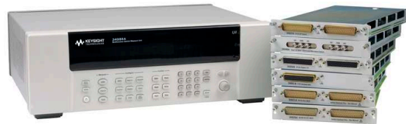
Figure 4. The Keysight 34980A Multifunction Switch/Measure Mainframe and Modules.