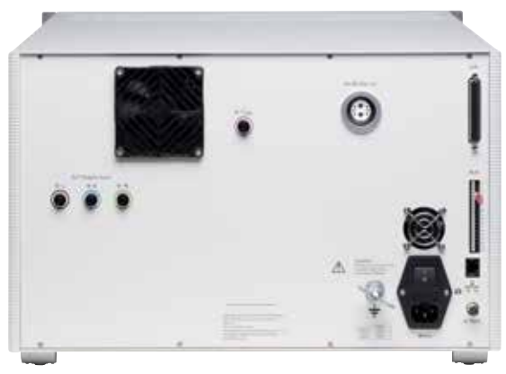
AXOS<sup>8</sup> rear view