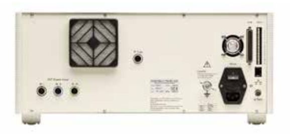
AXOS<sup>5</sup> rear view