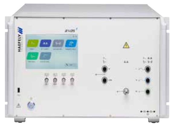
AXOS<sup>8</sup> front view

A wide range of cost-efficient and user friendly coupling / decoupling networks for power lines as well as for symmetrical and asymmetrical data- and signal lines are available as options.