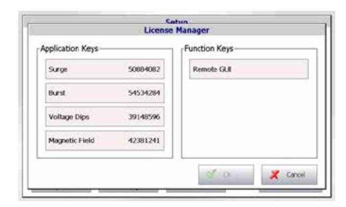
License Manager of the AXOS series

All AXOS test systems come equipped with all the hardware needed for instant upgrades by only entering optional key codes into the licence code manager of the unit. After entering the key code(s) the additional test functionalities like Surge Combination Wave, Ring Wave, Telecom Wave, EFT/Burst or Voltage Dips and Interrupts become available immediately. No direct intervention has to be done by the user at all.